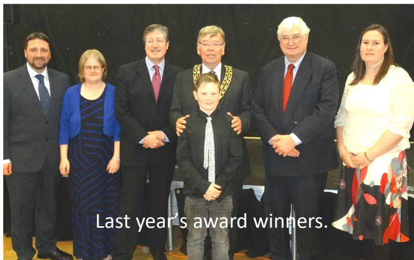
Last year's award winners.

If you know someone who has demonstrated extraordinary commitment, energy and effort in order to achieve something of great benefit to you or your community contact the Town Hall for a nomination form or download a form at www.witney-tc.gov.uk/citizen-of-the-year-and-the-civic-reception/