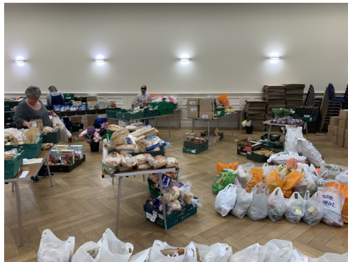
Witney Fridge and volunteers operating from the Corn Exchange – Photo Punam Owens

Prescriptions and emergency food parcels were delivered by countless dedicated volunteers. Window visits were made to people feeling the strain who needed a friendly face. The unfailing strength and generosity of our community manifested itself in any number of ways.