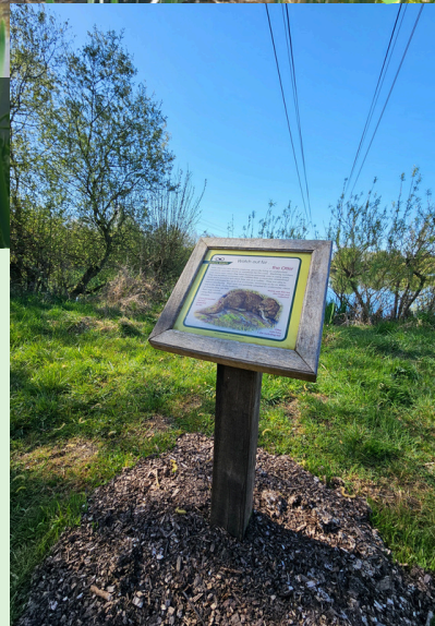
Information Board at the Southern part of the Lake