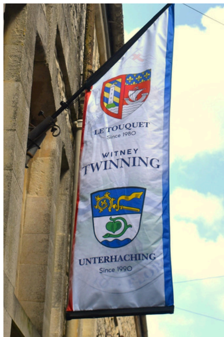
Witney Twinning Flag hanging on the side of the Corn Exchange

These long-standing partnerships are a celebration of unity, cultural exchange, and shared values. Here's to many more years of connection and collaboration!