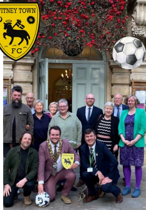
Witney Town Councillors with representatives of Witney Town FC