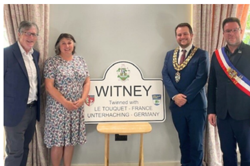
Witney Twinning Reception at the Corn Exchange

During the weekend visit, the delegation also enjoyed events at King's School, Witney Blanket Hall, Witney & District Museum, and the Witney Beer Festival.