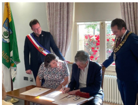
Re-signing the Twinning Documents

These long-standing partnerships are a celebration of unity, cultural exchange, and shared values. Here's to many more years of connection and collaboration!