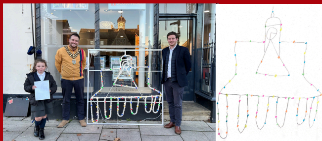
Last year's winner and their design of the buttercross