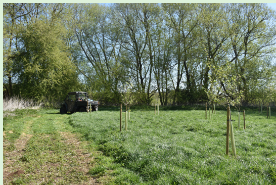
Lady's Orchard located at Snipe Meadow