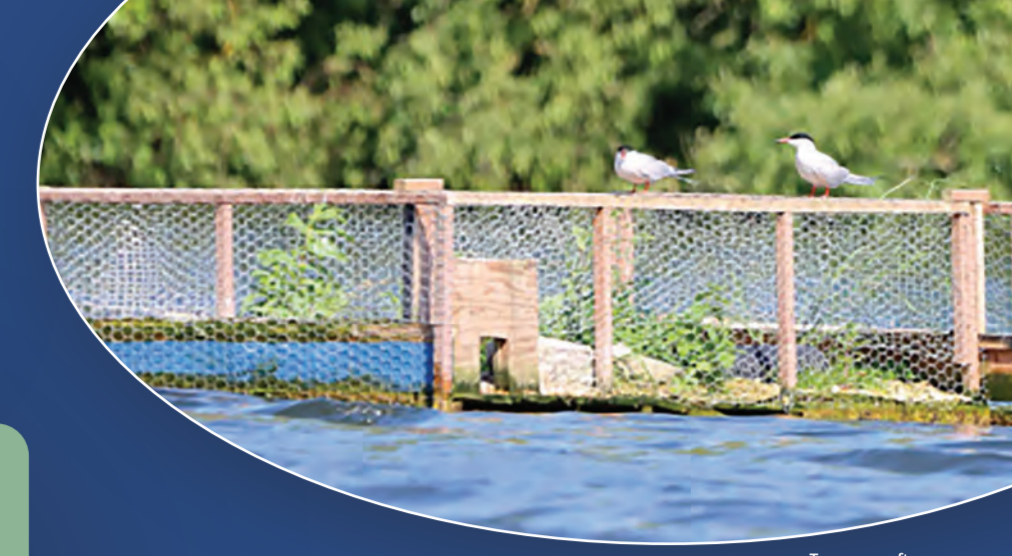
Terns on raft