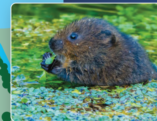
Water Vole

The meadows are traditionally managed, to encourage a range of wildlife. In winter, the river often floods this area, with the scrapes holding water late into spring. Look out for wading birds such as Snipe and Egrets, which come to feed.